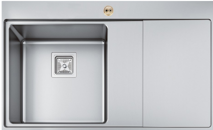
Right Drainer Shown