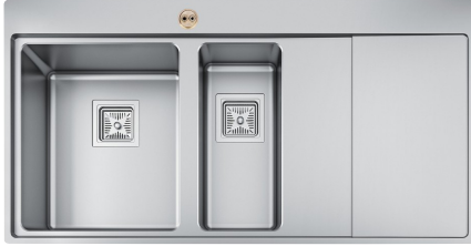
Right Drainer Shown