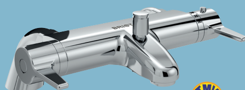
Design Utility Lever TMV2 Thermostatic Bath Shower Mixer