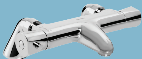
Artisan Thermostatic Bath Filler Chrome

Our Assure and Design Utility Bath Shower Mixers are also TMV2 rated for improved thermal performance and additional user safety.