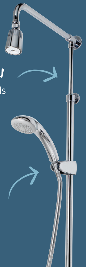
DOCM SHOWERING KIT DOCM-KIT

allows users to position shower at optimum height