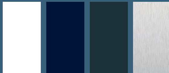
White Blue Grey Stainless Steel

Many of our products are available in blue or white corrosion resistant aluminium for durability, strength and hygiene. We also offer grey and stainless steel as special orders.*