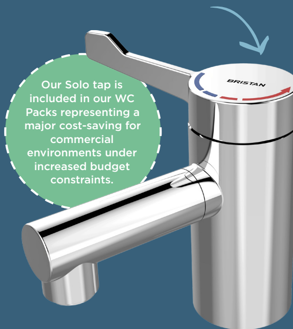
THERMOSTATIC MONO BASIN MIXER TAP SOLO2-T3SL

Single sequential control for temperature and flow